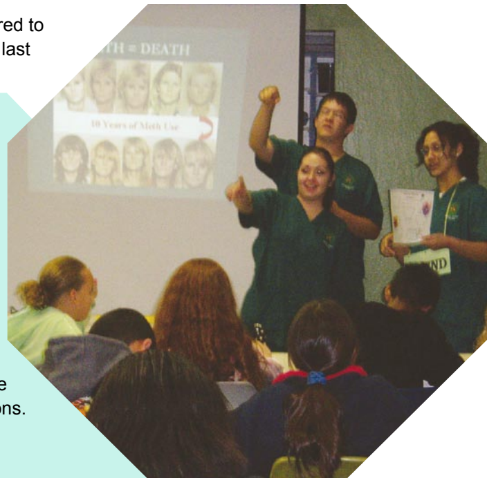
Students field answers from children about meth dangers.

As a result of a class presentation on methamphetamine delivered to CAVIT (Central Arizona Valley Institute of Technology) students last November, several students were motivated to take what they learned and create a lesson to teach 4 th and 5 th grade children. This age group was chosen because children are “sponges”, absorbing all that is shared. Students researched websites to become meth experts. CAVIT students learned that the best strategy for preventing meth use is to educate students at an early age about the harmful effects of meth drug use. CAVIT students used video clips and included meth drug pictures. The video clips and pictures provided a realistic view of the horrible effects of meth use. Students developed a skit, a Powerpoint, children’s activity and pre/post test assessment to determine changes in students’ attitude towards meth use. Results from feedback surveys indicate that children’s attitudes towards drug use changed and awareness of meth use increased after the student presentations.