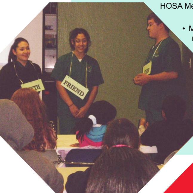
Students perform a skit about the behavior changes in people due to meth use.

CAVIT students learned that the best strategy for preventing meth use is to educate students at an early age about the harmful effects of meth drug use.